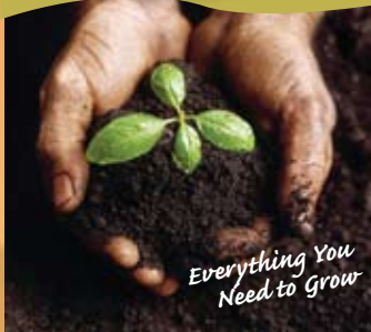
Everything You Need to Grow